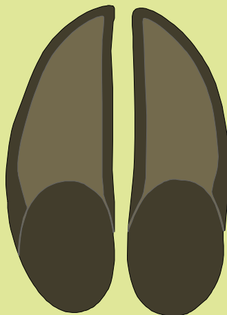
Red deer (hind)

A deer gives itself away as it is cloven hoofed, and so only has two toe digits.